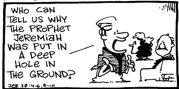
20th SUNDAY IN ORDINARY TIME