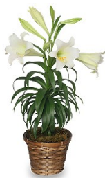
THE BODY AND BLOOD OF CHRIST

Someone has been providing them with way too much water. This is creating extra work for the person who handles our plants and has caused some of the plants to begin to rot or even perish, requiring replacement. Overwatering also damages the wood areas and soaks the rug where plants are placed. Please call the rectory at 860 673-2422 if you are the Mystery Waterer or have any information on who it might be. We would appreciate your help. Thank you.